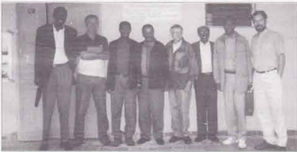
Dilla Workshop, instructors & facilitators.

The Dilla College of Education and Health Sciences proved to be an excellent location. Participants came from a wide area of southwestern Ethiopia. The faculty covered all the important sub-specialties and the course ran smoothly.