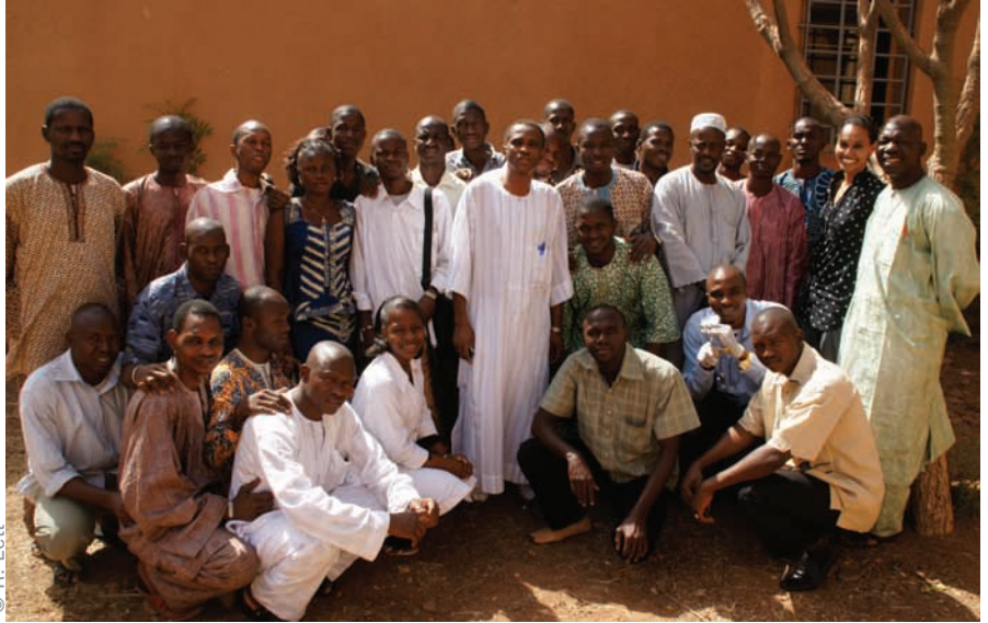
Participants at the recent ESS Providers course in Bamako, Mali