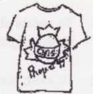
Size L, Black With Red

To order, contact the Prince George office.