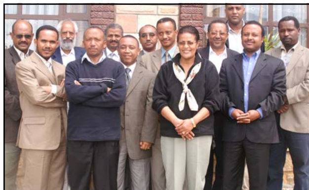
The management Committee in Ethiopia

TTT is a course conducted as part of injury prevention program in Tanzania and Uganda. The first TTT providers course was conducted in Addis Ababa September 2005 and funding is available for a second course. These initial courses were supported by the Wild Rose Foundation of Alberta. The TTT improves the casualty departments care of trauma victims.